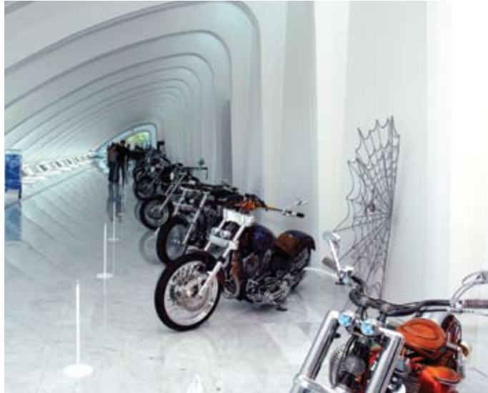
Finch custom cycles on display at Milwaukee Art Museum, courtesy of Hupy and Abraham, S.C.