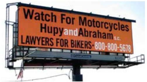
One of many different Hupy and Abraham, S.C. sponsored public service announcements during the Harley-Davidson 105th Anniversary